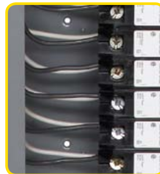
▲ Plug-on Neutral connection