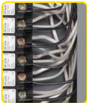
▲ Pigtail Neutral connection